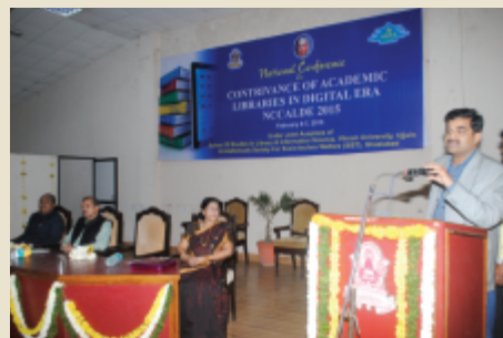
NCCALDE-2015 on 6-7 Feb 2015 at Vikram University, Ujjain

SUBSCRIPTION: Annual Subscription rates of following ISST Journals for calendar year 2018 (Vol. 9 No 1 & 2) are as below: