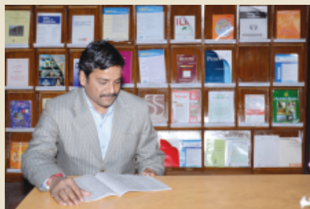
Institute Subscribing ISST Journals