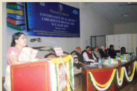
NCCALDE-2015 on 6-7 Feb 2015 at Vikram University, Ujjain